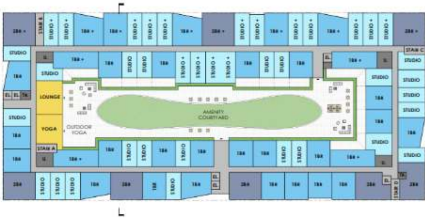
⊕ 2ND FLOOR PLAN Scale: 1" = 40'-0"

BRG HARRISON | LAMPWORKS HARRISON, HUDSON COUNTY, NEW JERSEY Copyright © 2024 by BRG Harrison and Lampworks